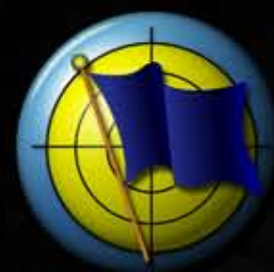
BLUE FLAG (Begins in 1977)

As tensions increased between the US and Communist Russia, the importance of the 505th mission grew. In September 1949, the group no longer operated B-25's yet they remained focused on early warning systems, supporting detachments up and down the Pacific Northwest coast. The group provided early warning operating radar systems to include the AN/TPS-1. With a growing movement to assign homeland defense to reserve units, the 505 ACWG was inactivated on 6 February 1952. However, this would not mark the end of the 505th. The Air Force would revive the unit and its expertise with radars 13 years later.